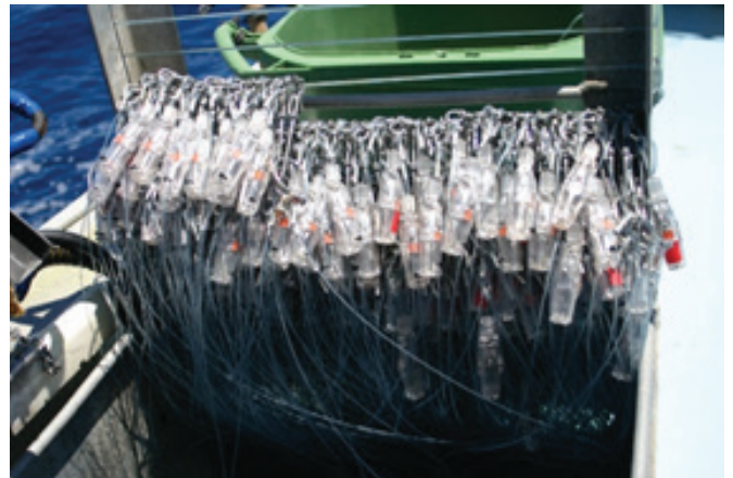
Pods can be hung from the hook in the swivel. This works best if the pods are placed < 1 m from the hook

NOTE If pods are fleeted in the setting bins it is recommended that a 'square' or carpet is placed between each row of branchlines. This prevents any potential for pods to slip down into branchlines below in rough seas.